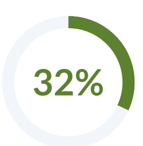
of donor-advised funds gave to International Affairs