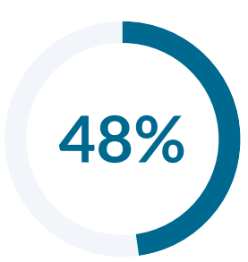
of donor-advised funds gave to Religion