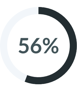
of donor-advised funds gave to Human Services